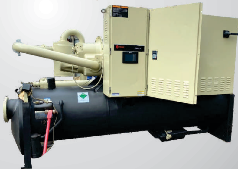
Trane RTHD D3F2F3V